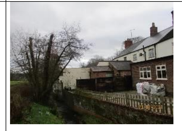
View to rear of 24 Nether Green