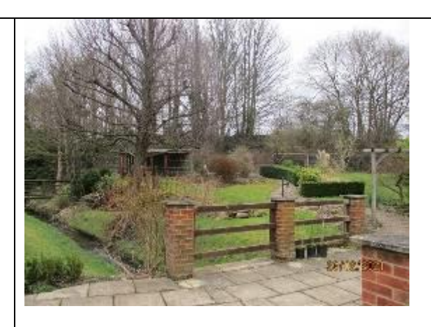
View to rear (east) boundary