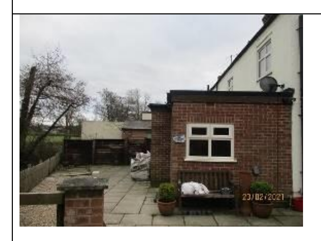
Side view of extensions