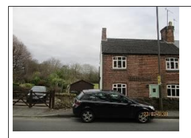
Front elevation and site of proposed side extension