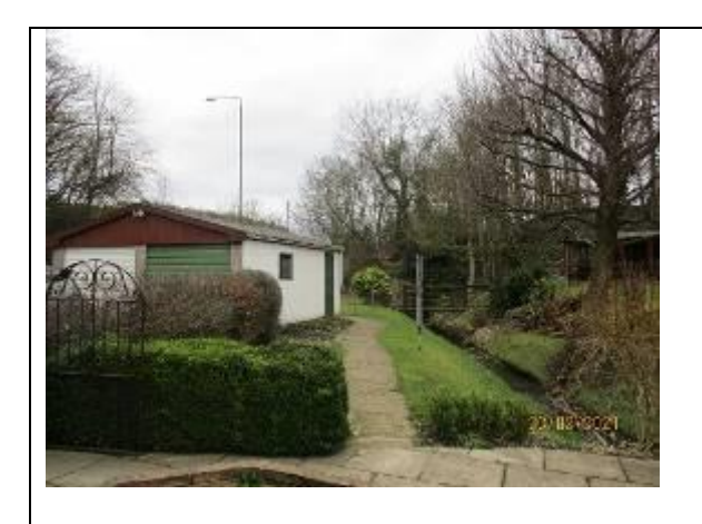
View north to boundary from side of the house