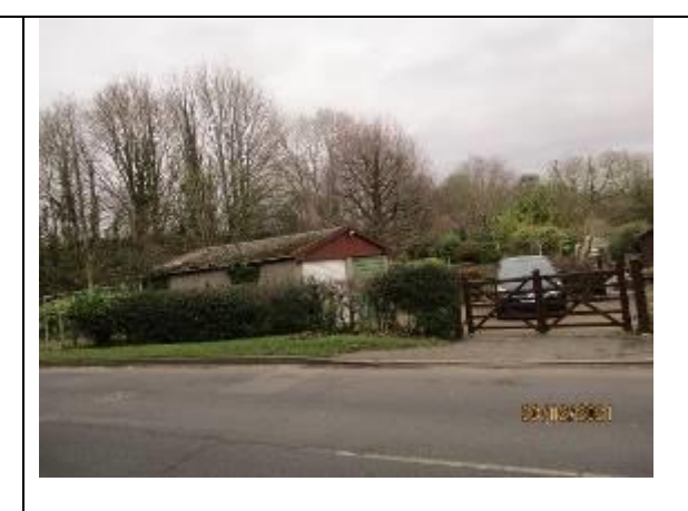
Existing drive access