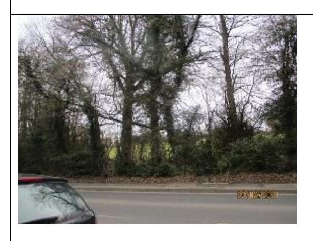
View across the road, opposite the site