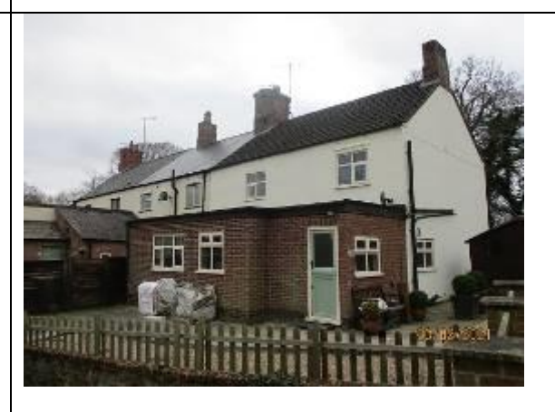
Rear elevation and existing extensions